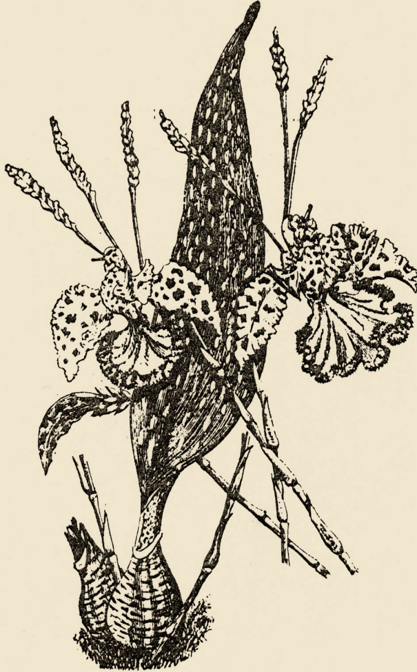
ONCIDIUM KRAMERIANUM COSTARICENSE. THE TRUE BUTTERFLY ORCHID.

O. carniferum. —This species, although plentiful in its native places, is from one of those localities where my usual collectors would never go; and as, in these cases, I depend upon pure chance, I can not fix a low price on it. On certain occasions I may be able to furnish it much cheaper than quoted in the list, while at other times I may be unable to get it for any money. Intermediate; much light; dry in winter.