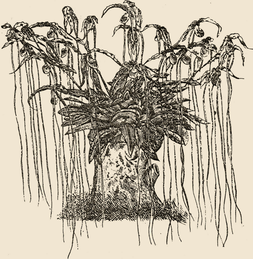
CRYPIDEDUM CAUDATUM. (Reproduced from a photograph.)

C. caudatum roseum (or, Selenipedium Warszewiczii ).—There is probably no other family of