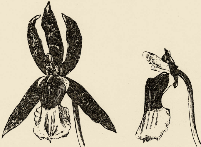
MILTONTIA SCHROEDERIANA. (In Veitch's Orchid Manual .)

M. triaristella. —Occurs in some places of that country, but is never called for. The culture given for M. astuta can be applied also to the other species.